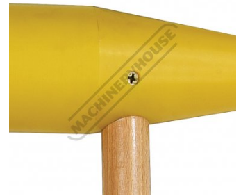
Head Screwed & Wedge Locked To Handle