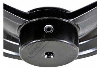
Grub Screw Attachment