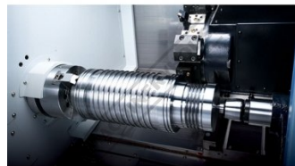
Puma 2600 Large Shaft