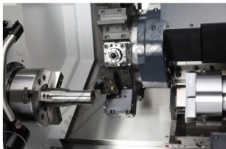
PUMA 2600SY Turning