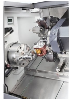
Puma GT Hobbing