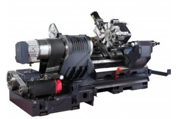
Puma 4100 Chassis