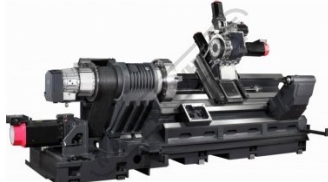
Puma 5100 Chassis