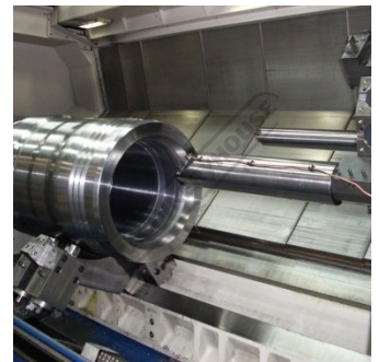
Puma 700 Boring