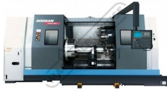
PUMA 800B Front Open