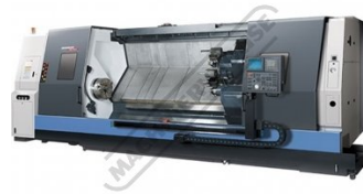
PUMA 800L Side