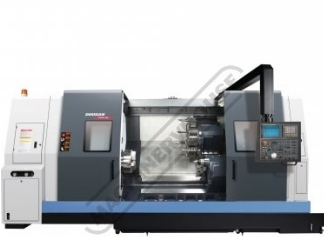
PUMA 800 Front Open