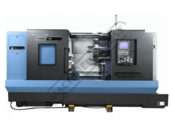
Puma 4100 Front View