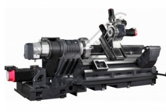
Puma 5100 Chassis