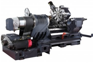
Puma 4100 Chassis