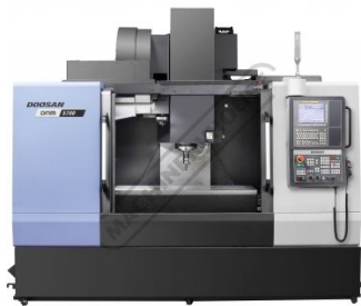
DNM 5700 Front Open