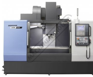
DNM 6700 Front Open