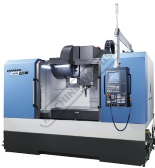
DNM 750 II Side Open