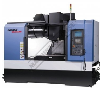
Mynx 5400 Side Open