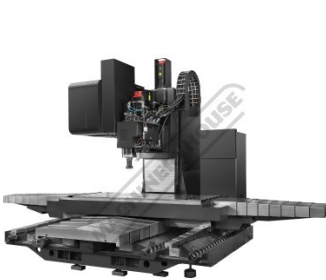
Mynx 9500 Frame