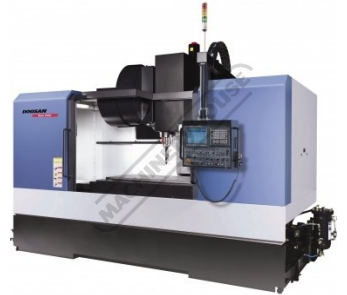
Mynx 7500 Side Open