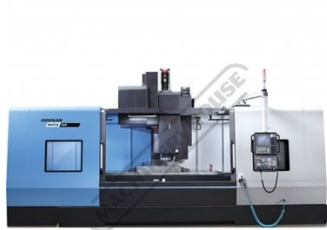
Mynx 9500 Front Open