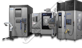
Auto Work Changer