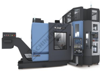
DVF 5000 AWC