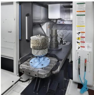
DVF 6500 4APC Internal Palette Change