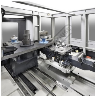
DVF 6500 4APC Interior