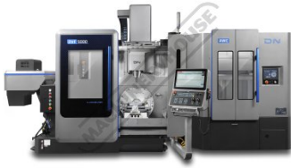
DVF 5000 AWC