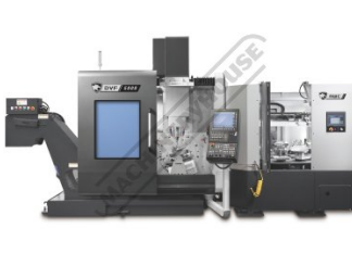
DVF 5000 12AWC