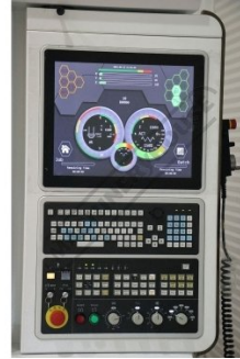
Hartrol Plus P2 Controller