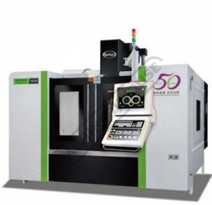
HCMC Hartrol Plus