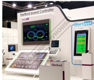
Hartrol Plus Large