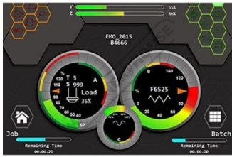
Hartrol Plus Main Screen