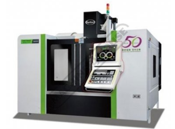
HCMC Hartrol Plus