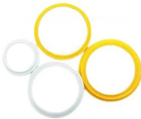
AL3009 Bottom Protective Lens Seal