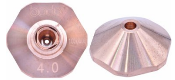
AL3022 4.0 Nozzle Double Layer