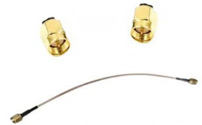
AL3011 Radio Frequency Cable