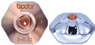
AL3023 5.0 Nozzle Double Layer