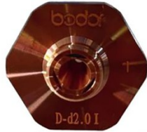
AL3020 2.0 Nozzle Double Layer