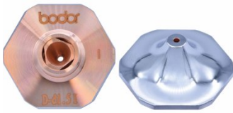
AL3019 1.5 Nozzle Double Layer