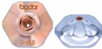
AL3021 3.0 Nozzle Double Layer