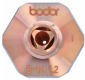
AL3017 1.2 Nozzle Double Layer