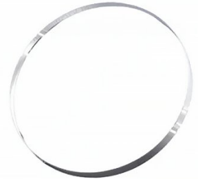
AL3051 Bottom Focus Protective Lens