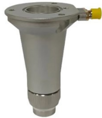
AL3059 Bottom Block