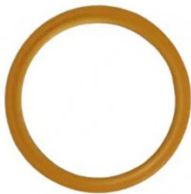
AL3064 Bottom Protective Lens Seal