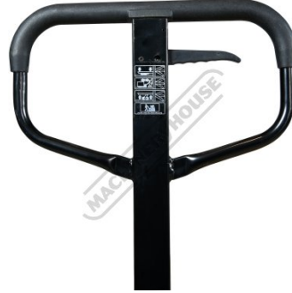
Handle In Neutral Position