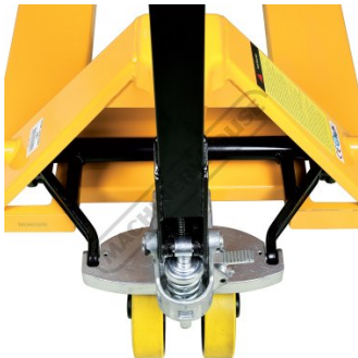
Rear Frame with Extra Cross Members for Additional Strength