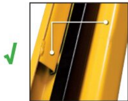
Welded Box Section