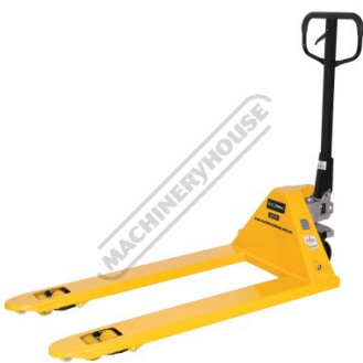
Side View Lowered