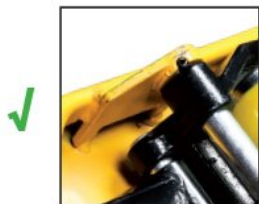
Heavy Duty Wheel Housing