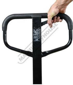
Handle In Release Position