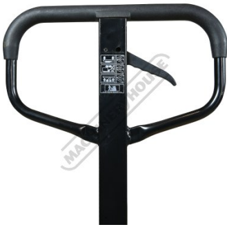
Handle In Engaged Ram Position