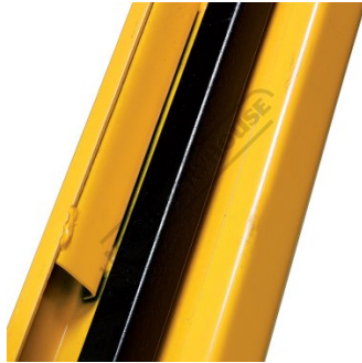
Frame with Rolled Edges and Welded In Box Section for Increased Strength