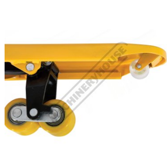
Front Wheel For Easy Pallet Entry