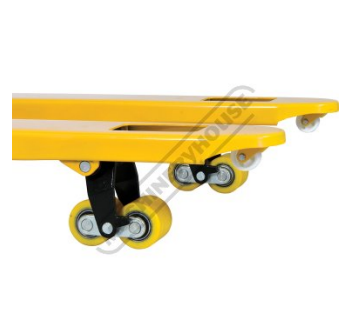
Front Entry Wheels Raised