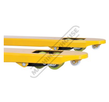
Dual Front Wheels Lowered