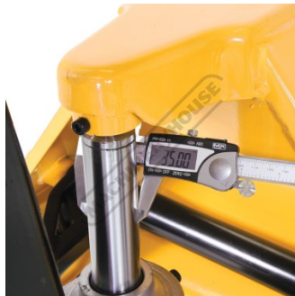
Large 35mm Diameter Piston Lifting Ram