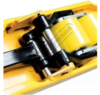
Front Wheel Hinge Reinforced Welded Bracket