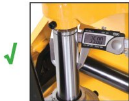
35mm Diameter Ram