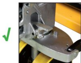
Foot Release & Heavy Base