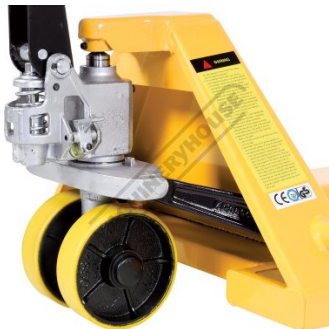
Large Double Rear Wheels