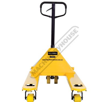
Front View Raised