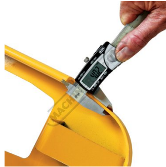
Channel Thickness 4mm