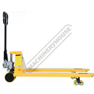
Side View Raised