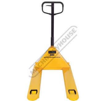
Front Entry View