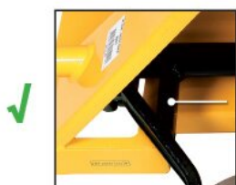
Extra Braced Frame