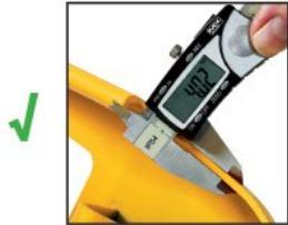
4mm Thick Steel Plate