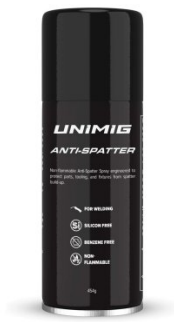
W119 Anti-Spatter Spray