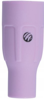
W5991 Ø10mm Ceramic Nozzle