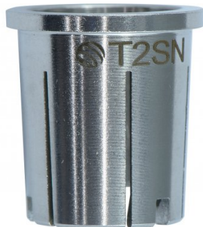
W5997 Heat Isolator