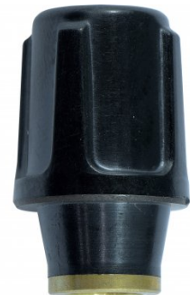
W5999 Short Back Cap