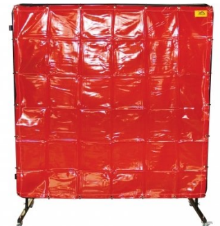
W225 Welding Curtain