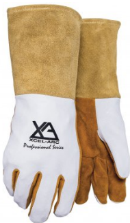
W101 TIG Welding Gloves - 310mm