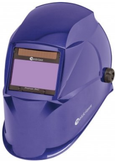
W002 Auto Darken Welding Helmet - 9-13 Shade