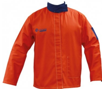
W1000A Promax HV5 Welding Jacket