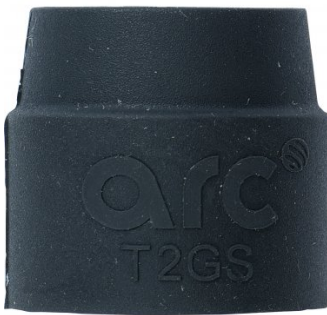
W5996 Head Gasket