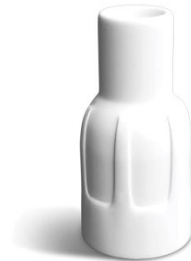
W6000 Ceramic Nozzle