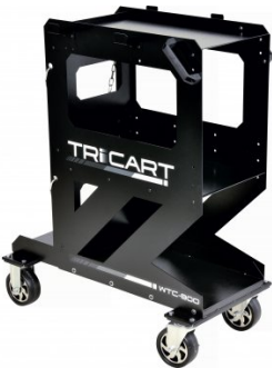
W2415 TRI-CART Multi-Machine Welding Trolley