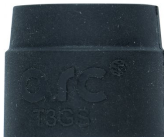
W6005 Head Gasket