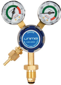
W160A Argon Gas Regulator-Twin Gauge