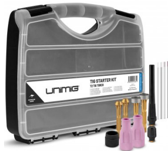
W505A T3 Tig Torch Consumable Pack