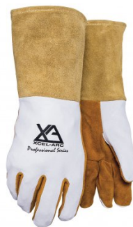
W101 TIG Welding Gloves - 310mm