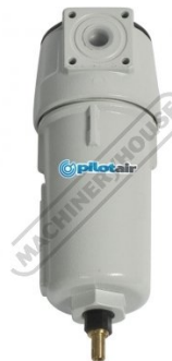
Refrigerated Air Dryer Pre Filter