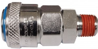
F945 High-Flow One Touch System Air Fittings