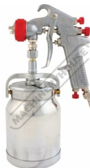
S325 Suction Spray Gun & Pot