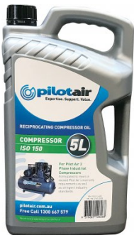
C346 ISO 150 Air Compressor Oil