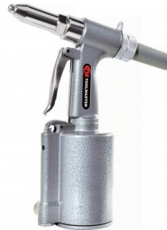
A046 Air Pop Rivet Kit