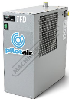
TFD-10 - Refrigerated Compressed Air Dryer