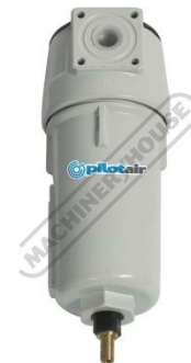
Refrigerated Air Dryer Post Filter 2