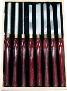
WT 8 HSS Wood Turning Tool Set