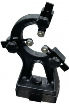
W378 Roller Steady