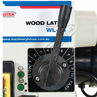
Variable Speed Lever