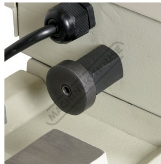
Swivel Head Release Lock