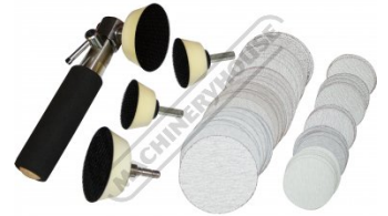
BSS 5075 Bowl Sanding Tool