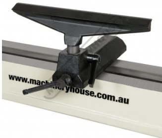
Standard Tool Rest