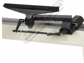
Outrigger Tool Rest