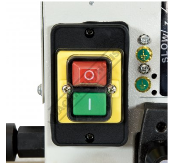
Switch On Off