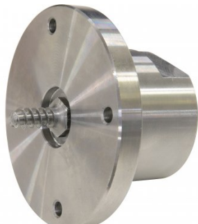
W297 Face Plate