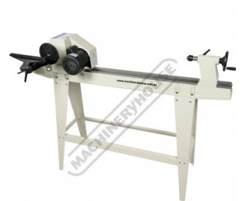
Bowl Turning Setup Right View