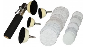
W305 Bowl Sanding Tool