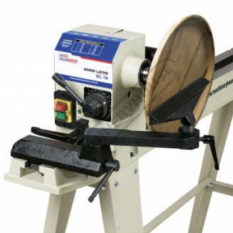
Shown Set Up with Bowl