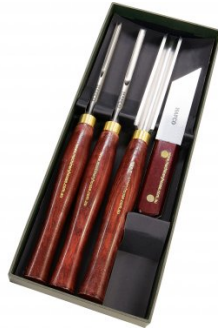
W3034 HSS Wood Turning Tools - 4 Piece Set