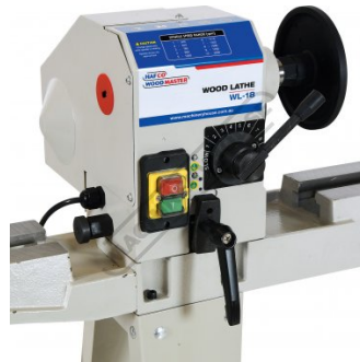
Headstock Left View