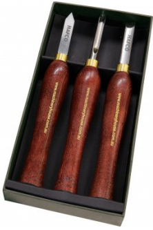
W3033 HSS Pen Turning Tools - 3 Piece Set