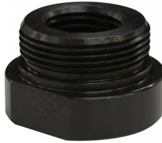
SCI 10 Scroll Chuck Insert