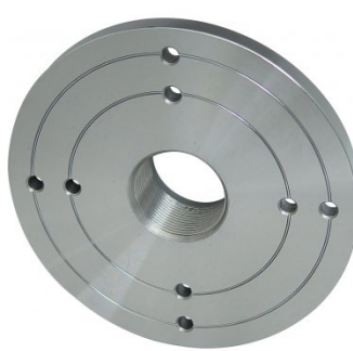
W298 Face Plate