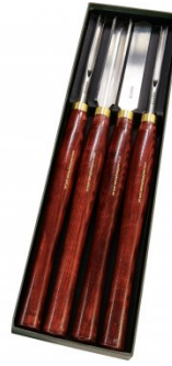
W3039 HSS Wood Turning Tools - 4 Piece Set