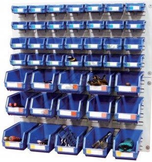
Tools Not Included