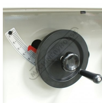
Blade Height Adjustment Handle and Angle Scale