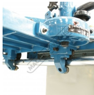
Heavy Duty Ball Bearing Table Slides