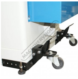
Swivel Wheels on Mobile Base with Leveling Screws