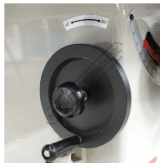
Tilt Arbor to 45 degrees