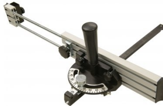
W458 Sliding Table