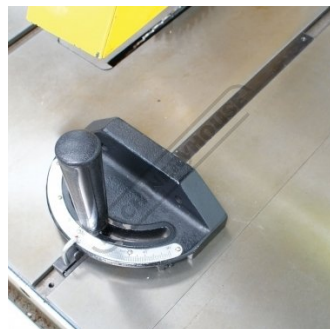
Heavy Duty Mitre Guide 60 degrees