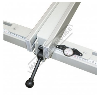
Single Lock Lever on Rip Fence with Magnified Scale