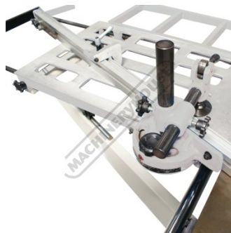
Sliding Table with Mitre Guide and Material Clamp