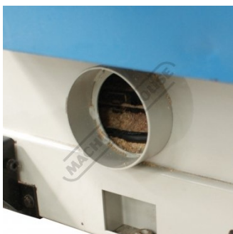
100mm Dust Chute