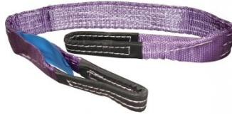
H316 Flat Slings