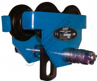
Includes 1T Girder Trolley