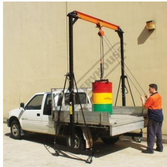
Shown Loading Oil Drum onto Ute