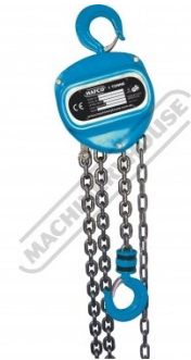
Includes 1T x Metre Chain Block