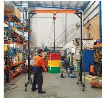
Shown Lifting Oil Drum