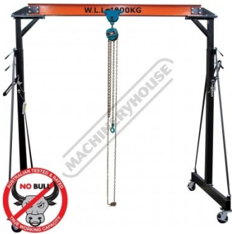
Mobile Girder Rail