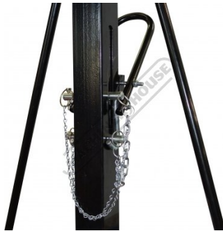
Support Pin Safety Chain with Lynch Pin Clips