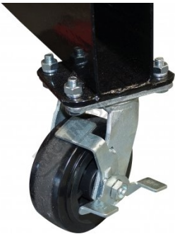
Swivel Wheels with Lock