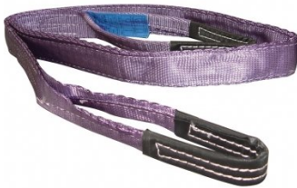
H318 Flat Slings