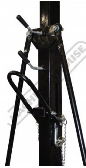
Lever Action Beam Height Adjustment