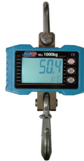
C191 Digital Crane Scale