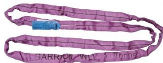
H308 Round Slings