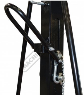
Safety Height Locking Pins