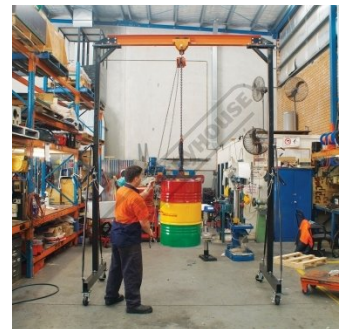
Shown Lifting Oil Drum