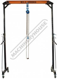
Shown at Full Height