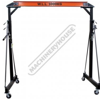
Mobile Girder Rail