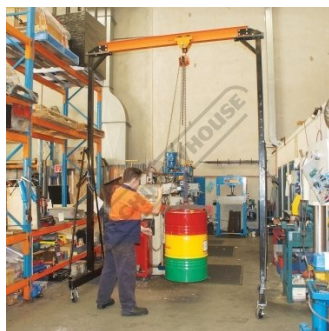
Shown Lifting Oil Drum 2