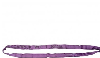
H300 Round Sling