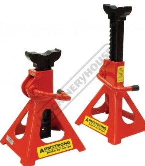
Shown At Lowest and Highest Ratchet Position