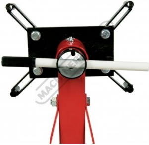
Index Lock Pin In Position 5