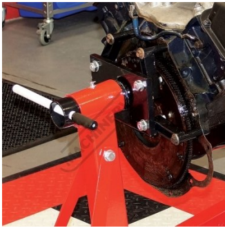
Mounting Position Shown with Ford 351 Engine