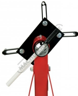
Index Lock Pin In Position 2