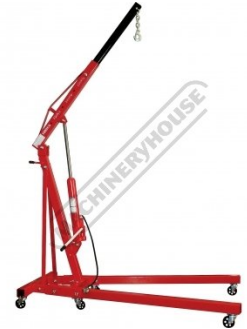
Shown Fully Up and Extended