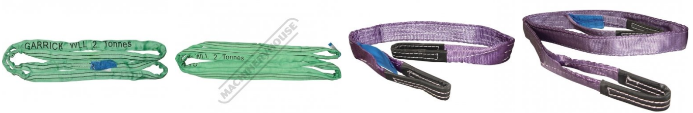
H320 Flat Sling