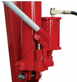
Single Action Pump With Release Valve