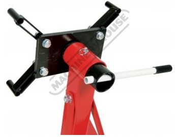
Handle and Index Lock Pin