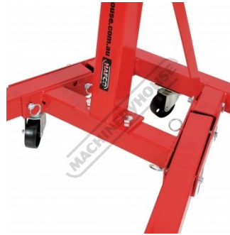
Leg Locking Pins Full View