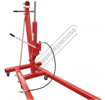
Pneumatic Hydraulic Single Action Ram