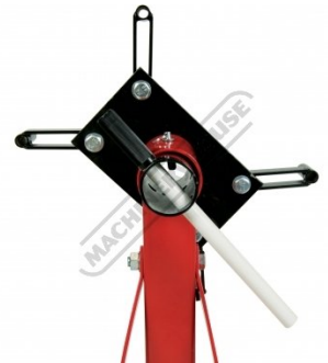
Index Lock Pin In Position 4