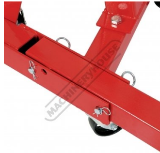
Leg Locking Pins