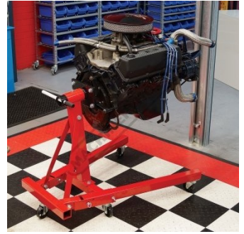
Shown with Ford 351 Engine Rear View