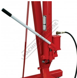
Single Action Manual Pump