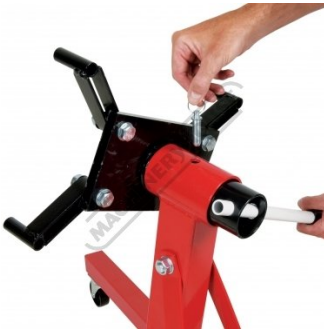
Index Lock Pin Released For Rotation