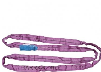
H305 Round Sling