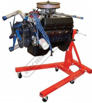
Shown with Ford 351 Engine Front View