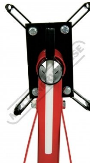
Index Lock Pin In Position 3