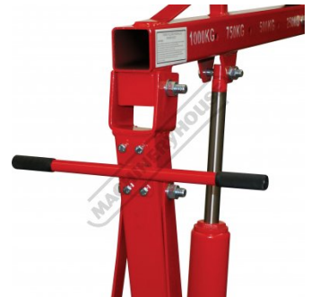
Handle For Easy Manoeuvrability