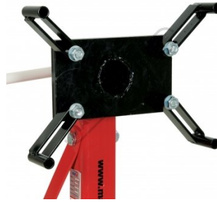
Four Adjustable Arms