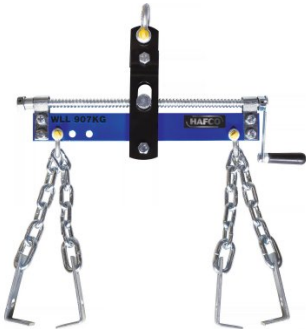
A3425 Engine Tilter - Heavy Duty