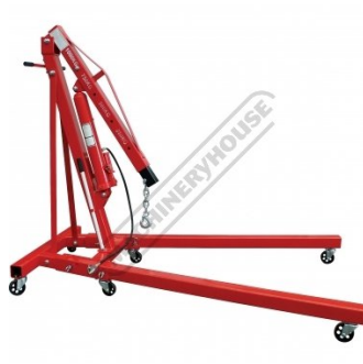
Shown With Ram Fully Down