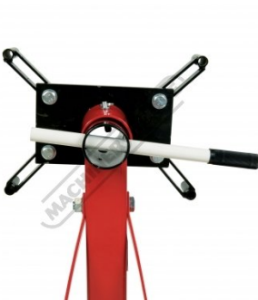
Index Lock Pin In Position 1