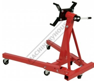
Rear Right View