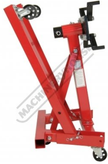
Fold Up Legs Side View