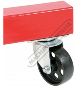
Five Swivel Castor Wheels