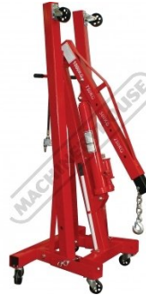
Shown Folded Up