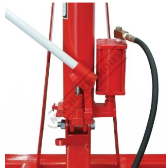
Pneumatic Hydraulic Pump