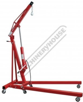
Shown Fully Up