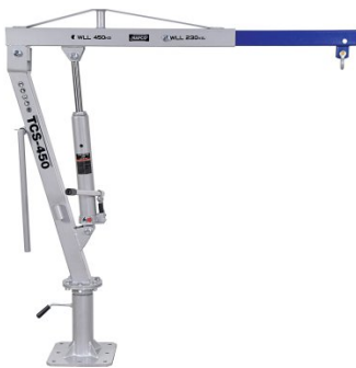
A353 Swivel Crane - Truck or Ute