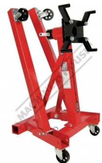
Fold Up Legs