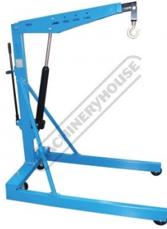
Beam at 1000kg Position