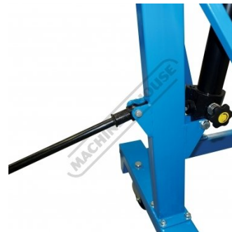
Pump Action Handle