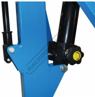
Beam Release Knob