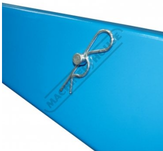
Safety Clip on Beam Adjustment Pin