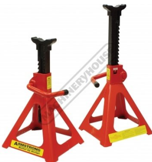
Front and Rear Views