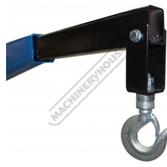
Tilting and Swivel Hook