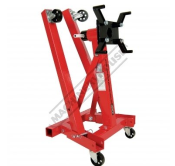
Fold Up Legs