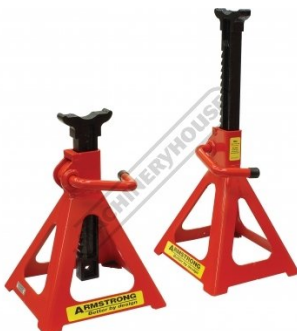
Shown At Lowest and Highest Ratchet Positions