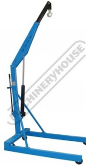
Shown Fully Raised