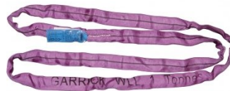
H305 Round Sling