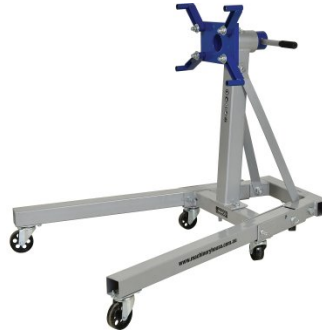
A341 Engine Stand - 450kg Capacity