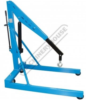
Shown Fully Lowered