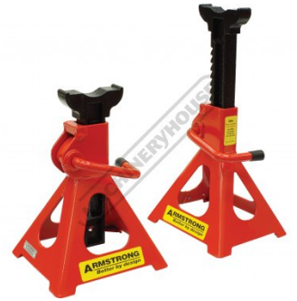
Shown At Lowest and Highest Ratchet Position