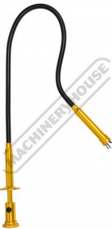
Pick Up Tool