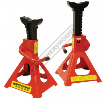
Front and Rear Views