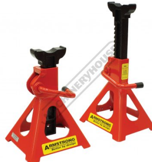
Shown At Lowest and Highest Ratchet Position