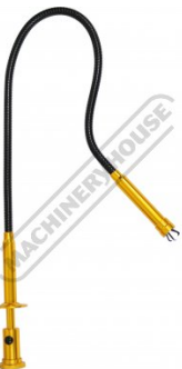
Pick Up Tool