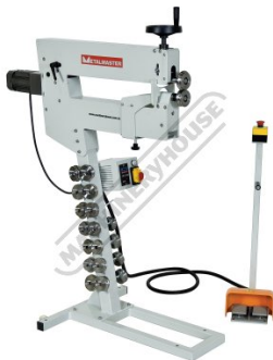
MBR-610XT - Bead Roller