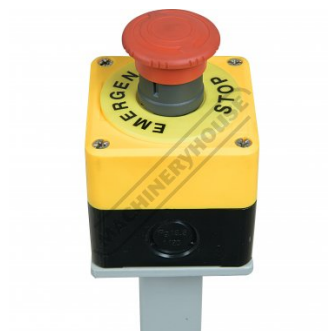
Emergency Stop Close Up