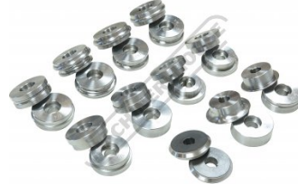
Profile View Of Die Sets