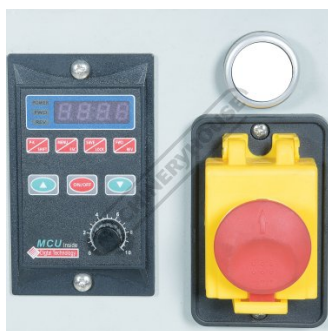
Speed Control and On Off Safety Switch