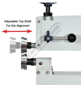
Adjustable Top Roller