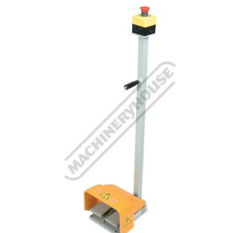
Forward and Reverse Foot Control With Emergency Stop Switch