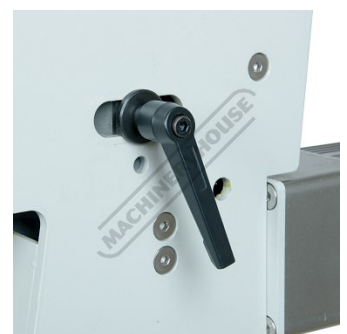
Locking Levers For Top Shaft Die Alignment