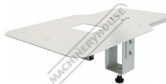
MBR-FWT - Steel Support Work Table