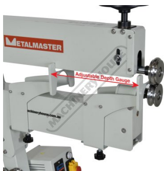
Adjustable Depth Gauge