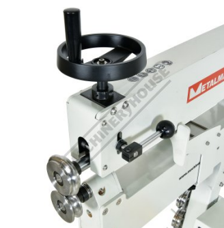
Upper Mandrel Adjustment Handle