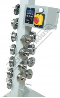
Die Rack Holders Right View