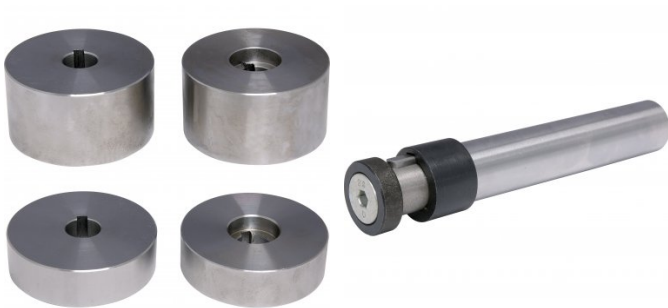
S6336 Mandrel Roller Holder