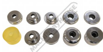
MBR-10K - Forming Bead Roller Kit