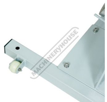
2 x Rear Wheels For Mobility