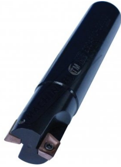
End View M521