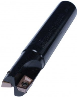
End View M520