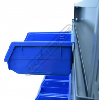
Optional Bucket Shown Clipped Onto Bracket