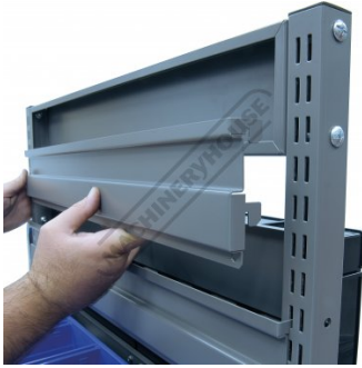
Optional Bracket Shown Clipping Onto Frame