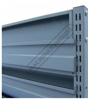
Optional Bracket Securely Clipped Onto Frame