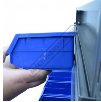
Optional Bucket Shown Clipped Onto Bracket