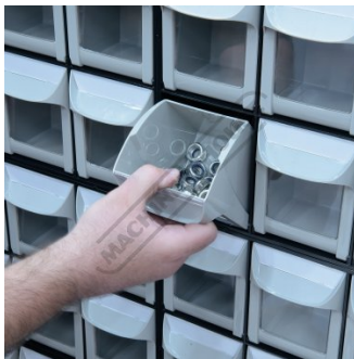
Removable Bins For Easy Access & Refilling