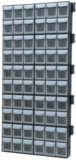
S0353 Parts Storage Bin System