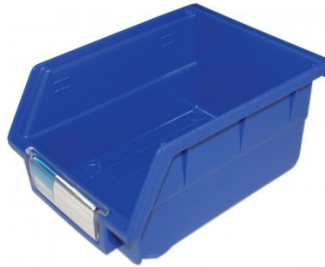
A432 Plastic Bucket