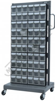
Few Buckets Shown Open