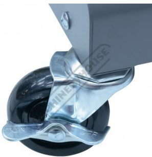
2 x Swivel Wheels with Brake