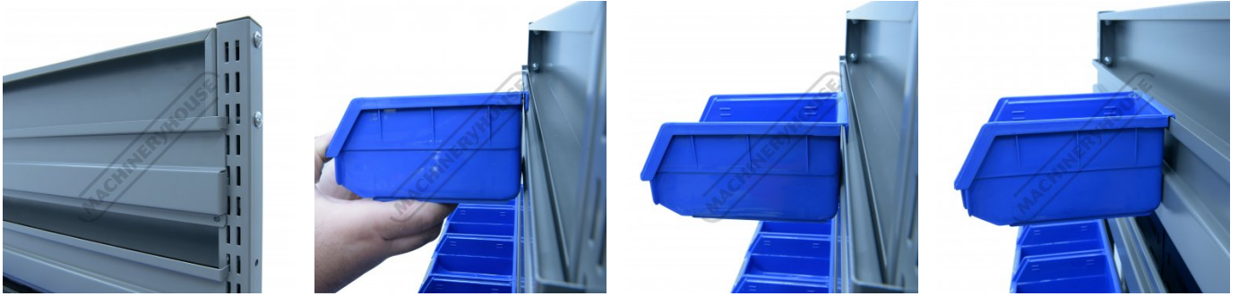
Optional Bracket Securely Clipped Onto Frame Optional Bucket Shown Clipped Onto Bracket Optional Bucket Shown Clipped Onto Bracket Optional Bucket Shown Clipped Onto Bracket