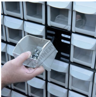
Removable Bins For Easy Access & Refilling