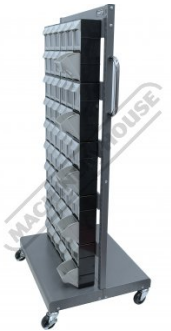
Right Side View Two Buckets Open