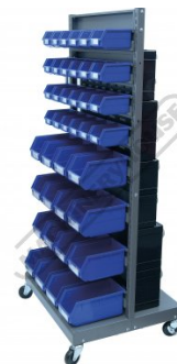
Shown with Optional Buckets A432, A434, A436