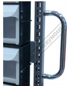
Chrome Handle Mounts on Left or Right Side