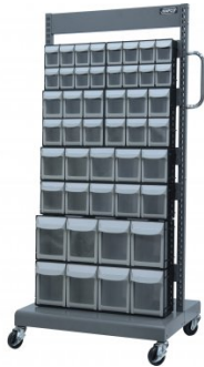
K200 Mobile Storage Bin Systems