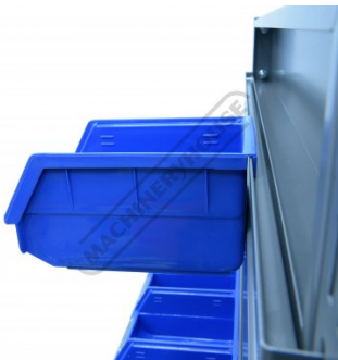
Bucket Shown Clipped Onto Bracket