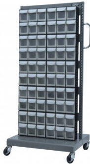
K204 Mobile Storage Bin Systems