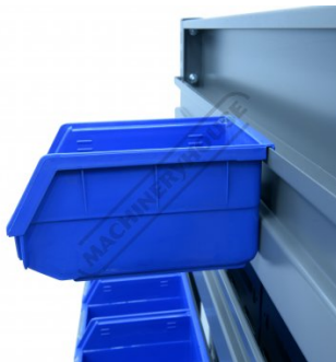
Bucket Shown Clipped Onto Bracket