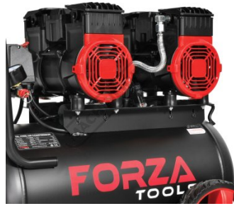
Twin 2hp Motors