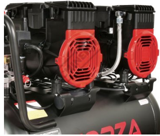
Twin 2hp Motors