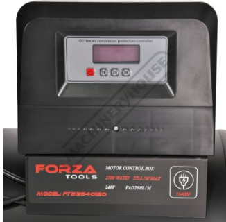
Digital Display & Controls