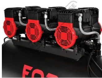
Triple 1.5hp Motors