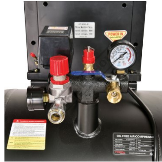
Pressure Gauge & System Valve