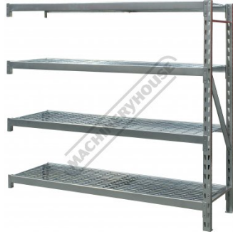
RSS-4WSA - Industrial Steel Shelving Extension