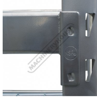
External Shelf Locking System