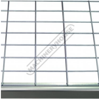
Shelf Wire Mesh