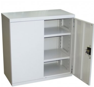
T774 Industrial Storage Cabinet