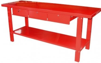
A380 Steel Work Bench - 3 x Lockable Drawers