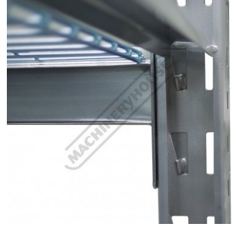
Internal Shelf Locking Wedge Type System