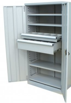
T762 Industrial Storage Cupboard