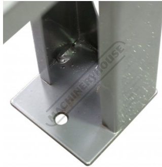
Foot Post with Bolt Down Provisions