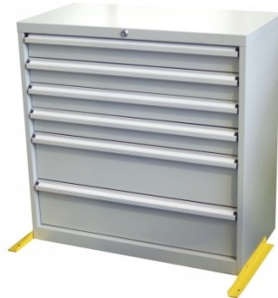
T775 6 Drawer - Industrial Tooling Cabinet