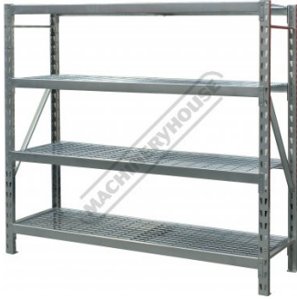
RSS-4WS Industrial Shelving