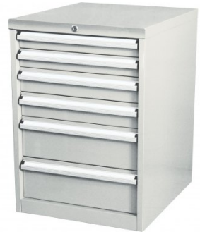
T764 6 Drawer - Industrial Tooling Cabinet