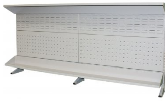
A426 Industrial Backing Panel - Bench Mount