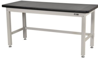
A420 Industrial Work Bench