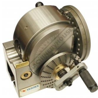
Left Rear View