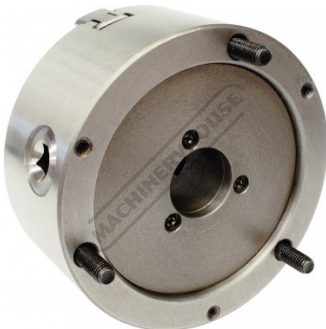
Chuck Rear View