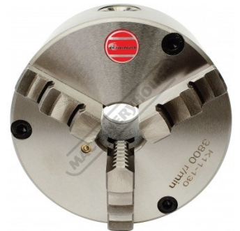
Chuck Front View