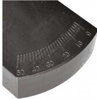
Adjustable Cutting Angle Up to 50 Degrees