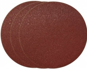
A5332 60G x 178mm (7") Aluminium Oxide Sanding Disc Pack