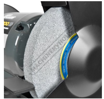
Coarse Aluminium Oxide Grinding Wheel