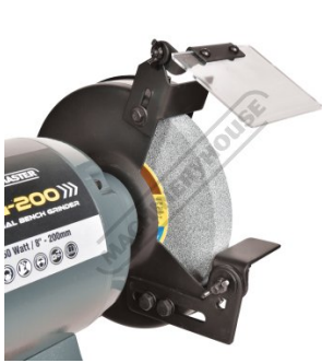
Adjustable Eye Shield Tool Rest