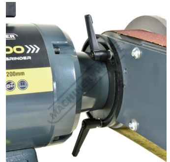
Quick Release Angle Adjustment