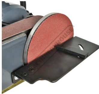
Adjustable Mitre Table