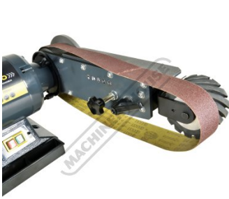
Quick Release Belt