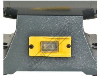
On Off Switch