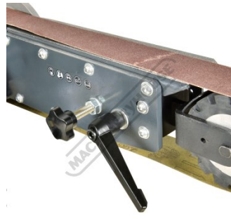
Belt Tensioner Adjustment