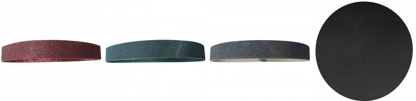
A5332 60G x 178mm (7") Aluminium Oxide Sanding Disc Pack