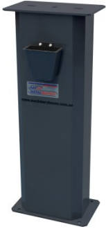
G189 0.5CT Grinding Wheel Dresser - Industrial Diamond Type