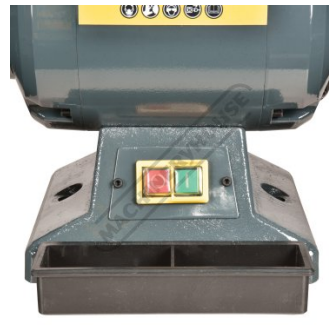
On Off Switch Cooling Tray