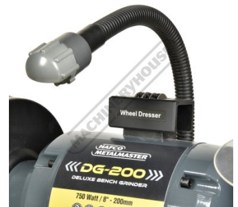
Wheel Dresser Work Light