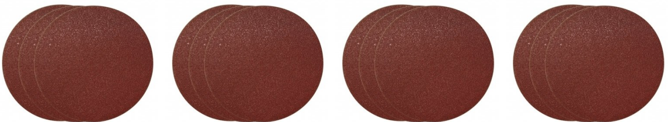
A5335 120G x 178mm (7") Aluminium Oxide Sanding Disc Pack