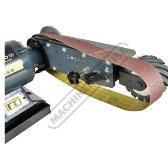
Quick Release Belt