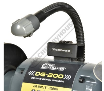
Wheel Dresser Work Light