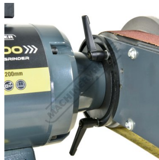
Quick Release Angle Adjustment