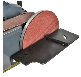
Adjustable Mitre Table