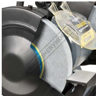
Fine Aluminium Oxide Grinding Wheel