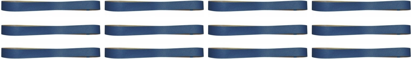
A8041 120G Zirconia Linishing Belt Pack