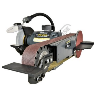
Included Adjustable Tool Rest