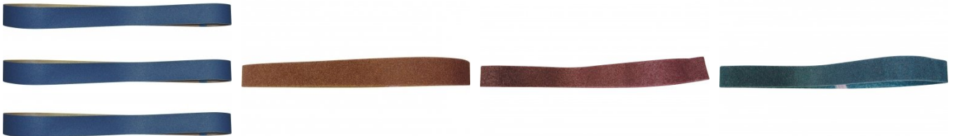
A48203 Scotch Belt Linishing Belt - Super Fine Grey