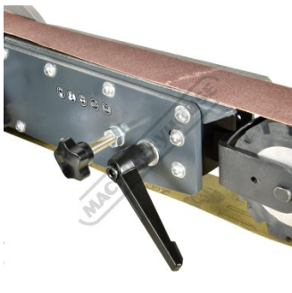
Belt Tensioner Adjustment