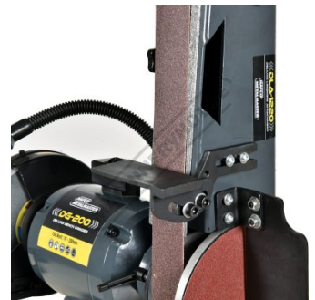
Vertical Position With Tool Rest