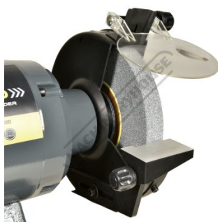
Adjustable Eye Shield Tool Rest