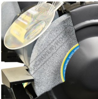
Coarse Aluminium Oxide Grinding Wheel