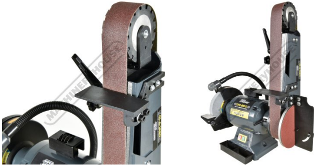
Vertical Position With Tool Rest Mitre Table Vertical Position With Tool Rest Mitre Table