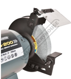
Adjustable Eye Shield Tool Rest