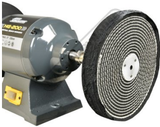
2 Section Buffing Mop Attached To G162