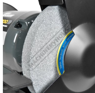
Coarse Aluminium Oxide Grinding Wheel