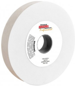
G171 White - Alox Grinder Wheel