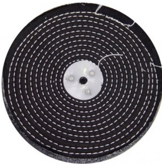
G186 Buffing Mop