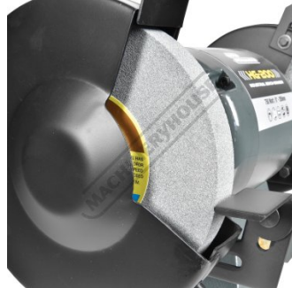
Fine Aluminium Oxide Grinding Wheel