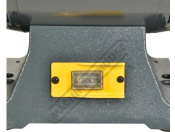
On Off Switch