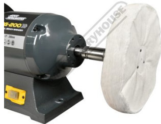
50 Fold Buffing Mop Attached To G162