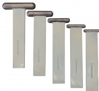
S223 Straight Steel T-Dolly Set Small - 5 Piece