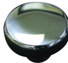
B8973 Stretch Flat Bottom Die