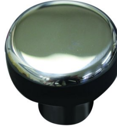
B8970 Doming Bottom Die