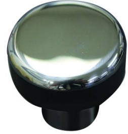
B8969 Doming Bottom Die