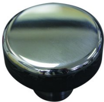
B8972 Doming Bottom Die