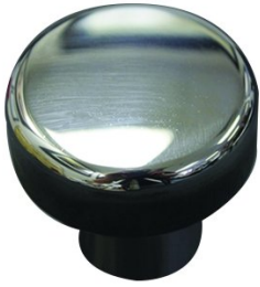
B8968 Doming Bottom Die