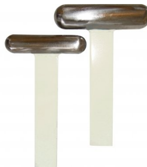
S2231 Straight Steel T-Dolly Set Large - 2 Piece