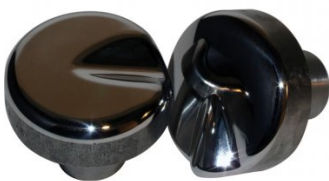
B9056 3" Thumbnail Shrink Die Set