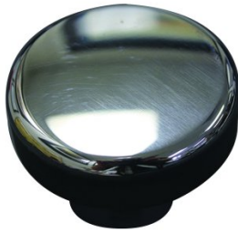
B8967 Doming Bottom Die