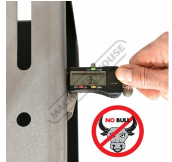
3mm Thick Bench Top