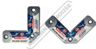
45, 90 & 135 Degree Magnets