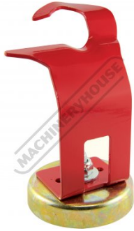
Magnetic Torch Holder