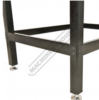
Steel Leg Bracing