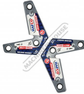
Multi Angle Magnets