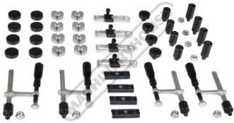
Square & Round Welding Table Clamp Kit