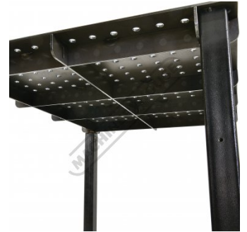
Rib Design for Strength