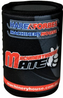
Magnetic Stubby Holder