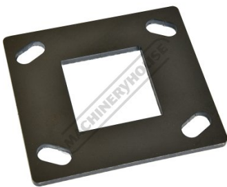
Includes 4 x Base Plates for Optional Castor Wheels