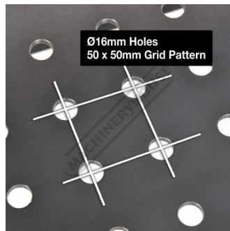
16mm Holes with 50 x 50mm Hole Centres