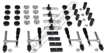
40 Piece Clamp Kit