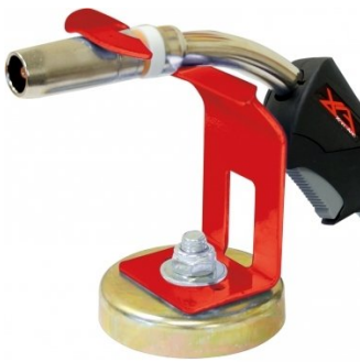
W10362 Magnetic MIG Torch Rest