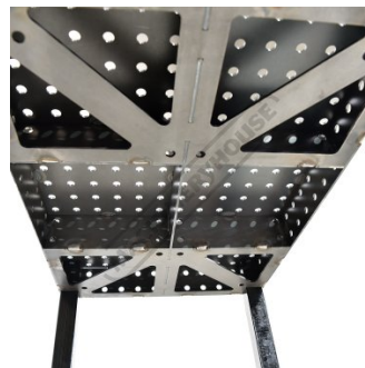
Rib Design for Strength