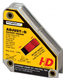
W1007 Adjust-O Magnet Square - Heavy Duty