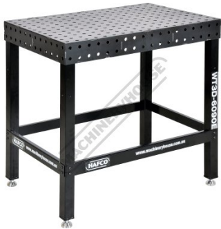
600 x 900 x 100mm 3D Welding Table