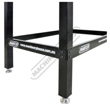
Steel Leg Bracing with Adjustable Feet