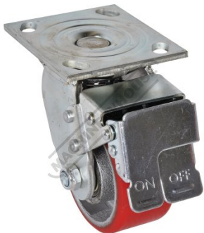
2 x Swivel Wheel With Brake