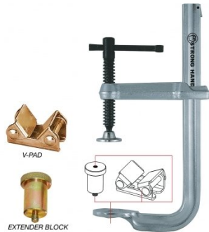
W1025 4 In One Utility Clamping System