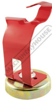
Magnetic MIG Torch Holder