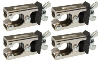
W112 Micro Welding Steel Clamp Set