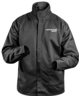
W1003 Rogue Welding Jacket