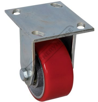
2 x Fixed Wheel