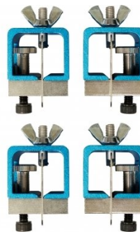
W113 Butt Welding Aluminium & Steel Clamp Set